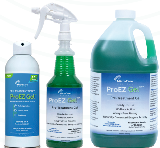
Green tint for visible coverage.